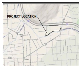
PROJECT LOCATION MAP 1"=1000'

NOTE: THIS SKETCH PLAN HAS NOT RECEIVED APPROVAL FROM ALL REVIEWING AGENCIES HAVING AUTHORITY AND IS THEREFORE SUBJECT TO CHANGE. THIS PLAN IS NOT FOR CONSTRUCTION.